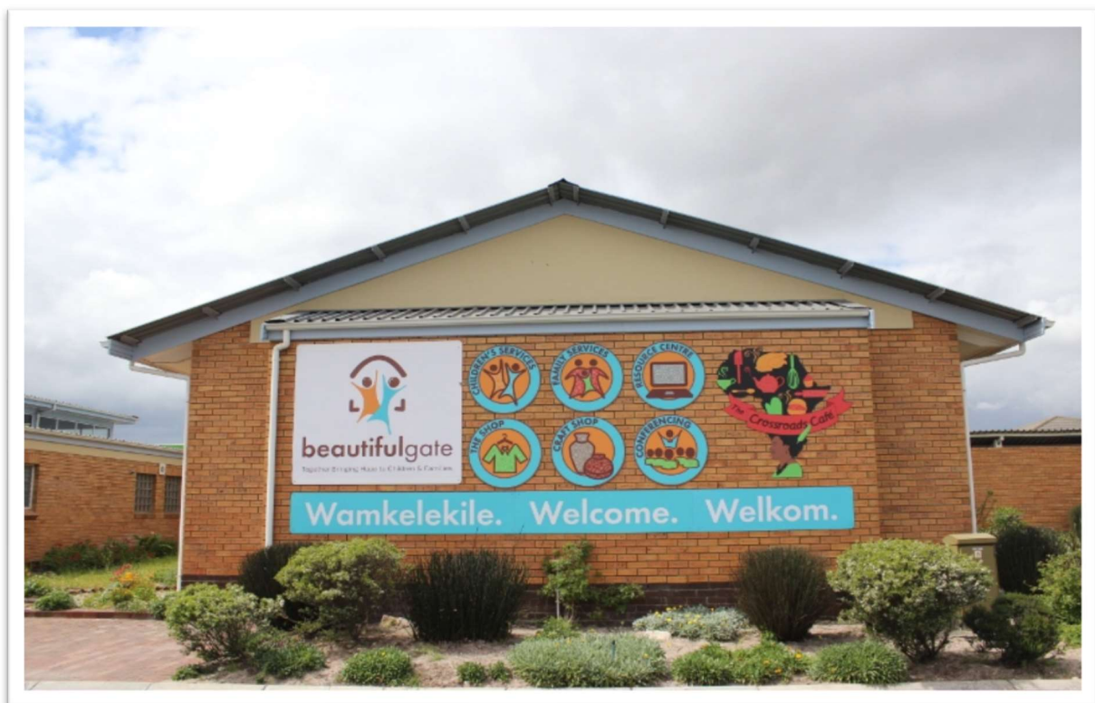
Beautiful Gate from the street

The best thing that we would be able to do was not to come up with a new way to solve inequality, it was to come alongside and help others who are already doing it. So, our Big Idea was to make a partnership between Bishops and the NGO Beautiful Gate, which is already doing so much to help people who have been disadvantaged due to inequality.