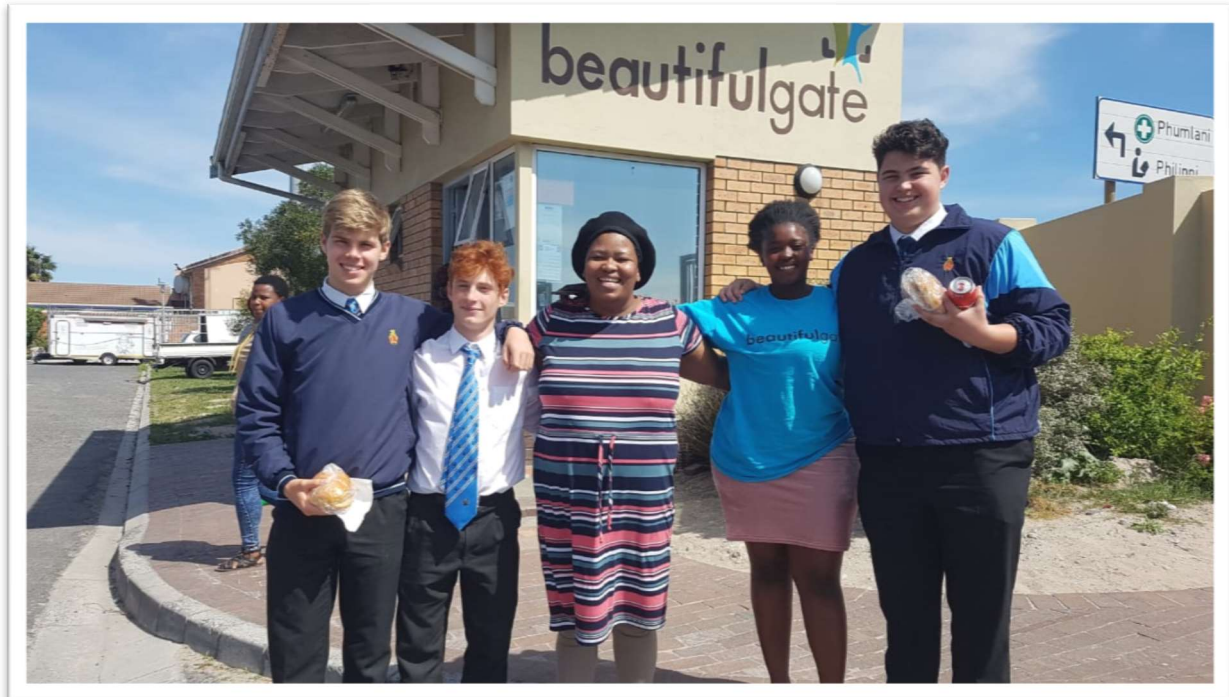
Us eating vetkoeks outside Beautiful Gate