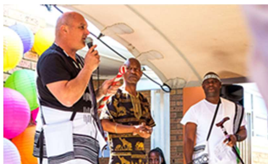
Another picture from the Annual Celebration

The meeting was awesome, we learnt so much more about Beautiful Gate. We made these notes from the interview as you can see.