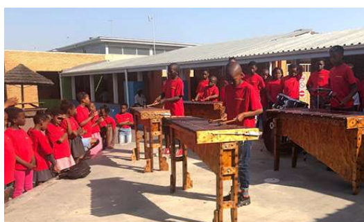
Kids at Beautiful Gate playing the Marimbas