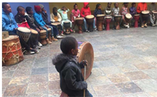
Kids at Beautiful Gate playing the Drums

I'm glad that we chose beautiful gate as our NPO to work with. They are really well established and they are doing what our project is about, solving inequality.